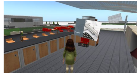
Gamification elements like treasure hunt and mood board can be added.