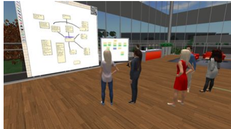
The Multifunctional Room is the place for group exercises. Several tools like presentation walls, screen sharing, white boards, pin boards and flip charts are available and flexible in usage.