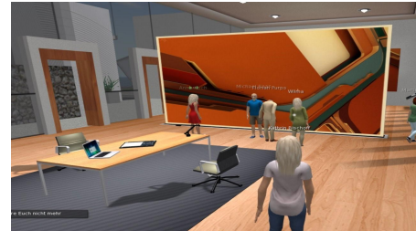
The Simulation Room is being used for role-playing games; equipped with a table for the protagonists, an observer room and a mobile wall transparent on one side.