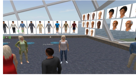
Changing room is being used to alter the look of the avatars.