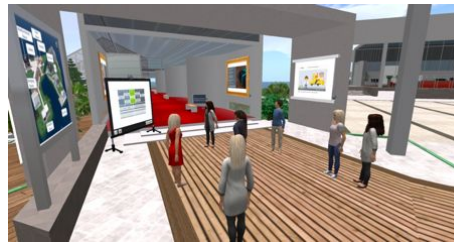
In the art gallery, participants stroll from picture frame to picture frame. These frames can be filled with content in advance by the presenter, by that making the room suitable for guided tours with moderation or self-learning sequences.