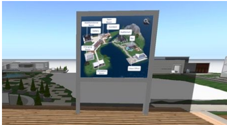
The AULA map provides orientation and allows quick navigation to other locations on the island.