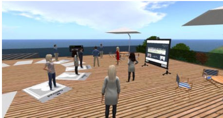
The sundeck is being used for the opening via the moderators and the introduction of participants.