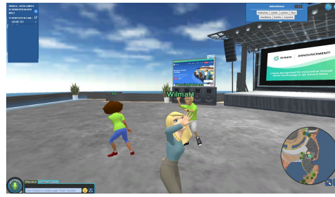
Dancing on the rooftop