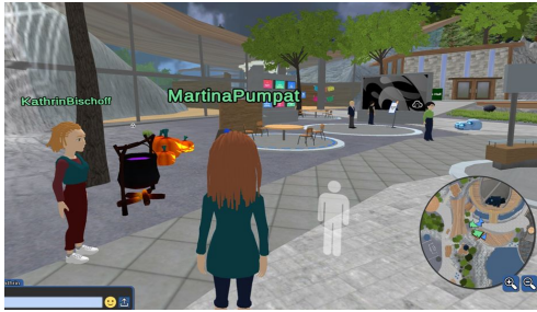
Arrival at Virbela