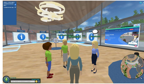
Gathering of avatars in collaboration room