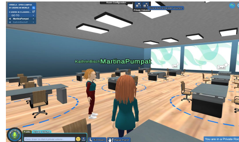
Different options for room settings available