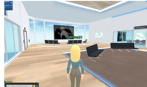
Rooms for group discussions and collaboration