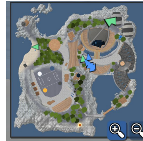
Orientation via map