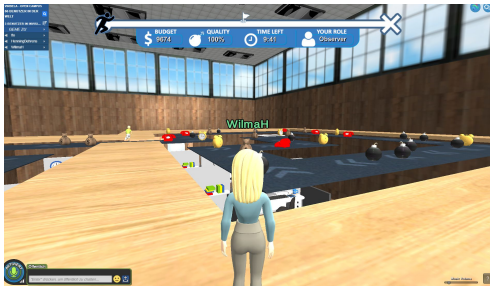
The hidden path game