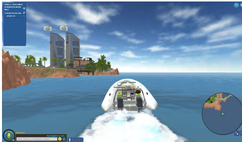
Speed boat ride